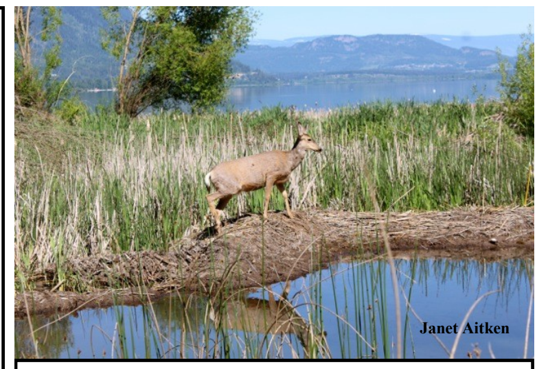
A deer walks on the edge of one of the Beaver ponds on the Foreshore

If you know the answer, let us know. Last fall there was a lot of activity on the CP rail side of the trail near the West gate, which caused the water to back up and flow over the trail. This is no longer happening. Perhaps they have moved on to pastures new!